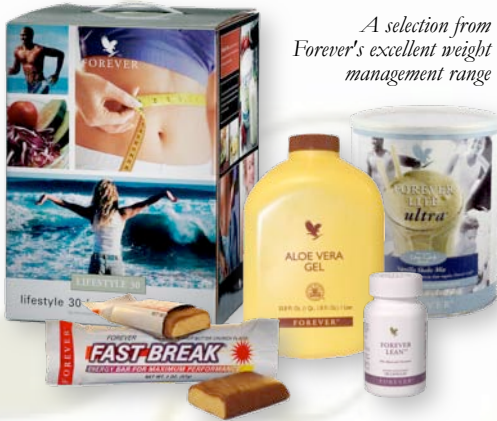
A selection from Forever's excellent weight management range