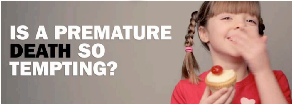
Shock advertisement from http://4yourkids.org.uk/ – But does it make you think about what you eat?

W e really are what we eat! Food is now as cheap as it has ever been in this country. Results from the Office for National Statistics show that the proportion of household income going on food and soft drinks now comes to just 15% (2006). That is less than half the share it took when the first Family Expenditure Survey was conducted 50 years ago.